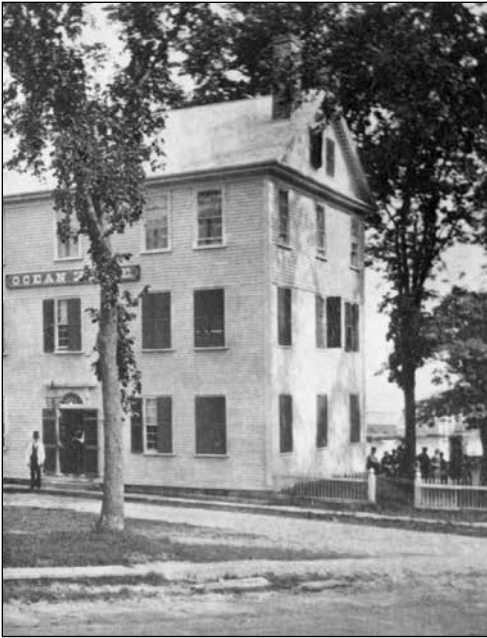
Before the Camden Public Library was built, the Ocean House Hotel stood at the corner of Route 1 and Atlantic Avenue on the hill where the library now stands (1880 photo).